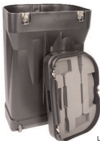
Lid with internal foam insert for lighting storage